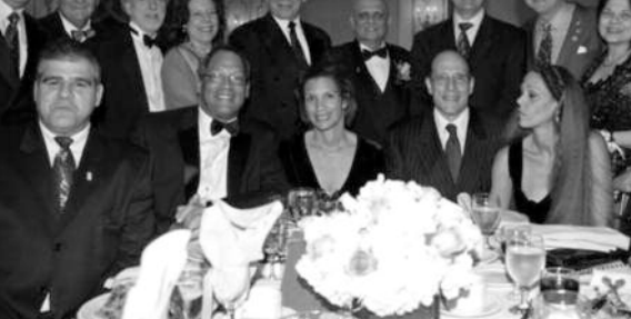
Many came to cheer on the new slate of officers