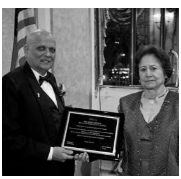
in recognition of his NYSDA presidency