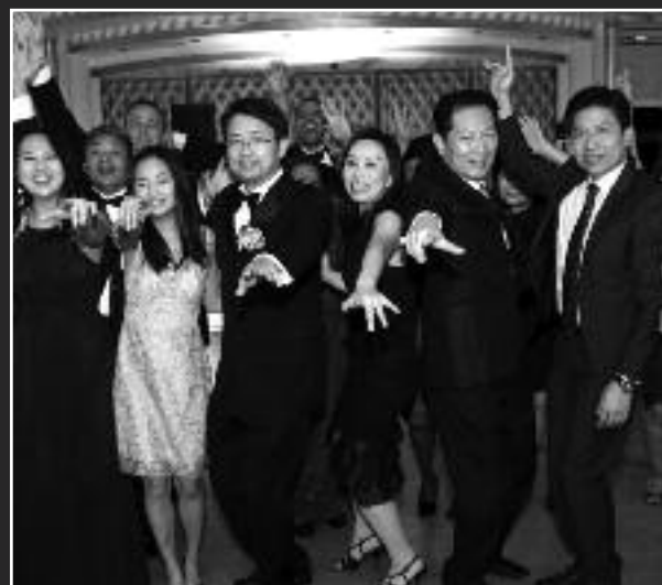
Guests had a great time at the QCDS installation.