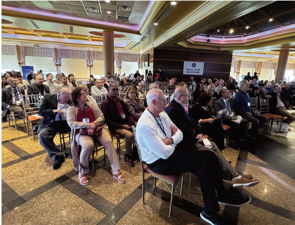
A large turnout of Queens County Dental Society members heard presentations on a wide variety of topics at the World's Fair of Dentistry.