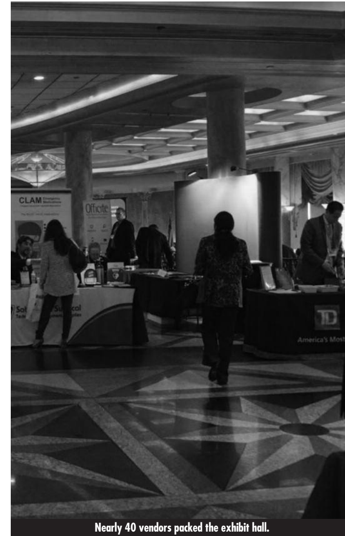
Nearly 40 vendors packed the exhibit hall.