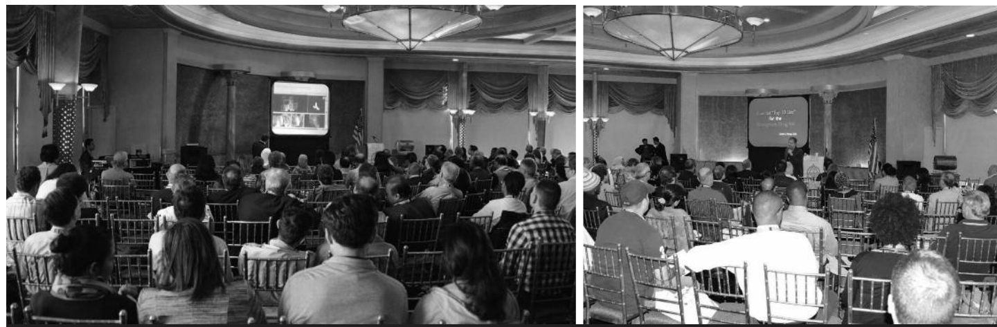
Participants enjoyed 14 hours of CE credits over the weekend.