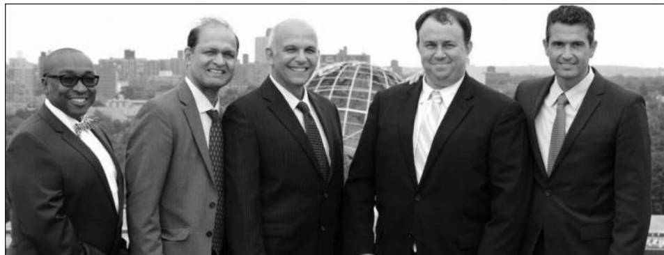
The organizers for a wonderful World's Fair of Dentistry!