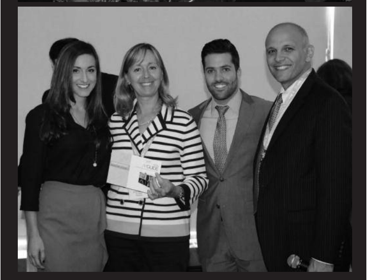
Lucky raffle winners collected their prizes.