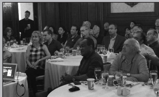
Almost 50 dentists attended the discussion on implantology in Sands Point.