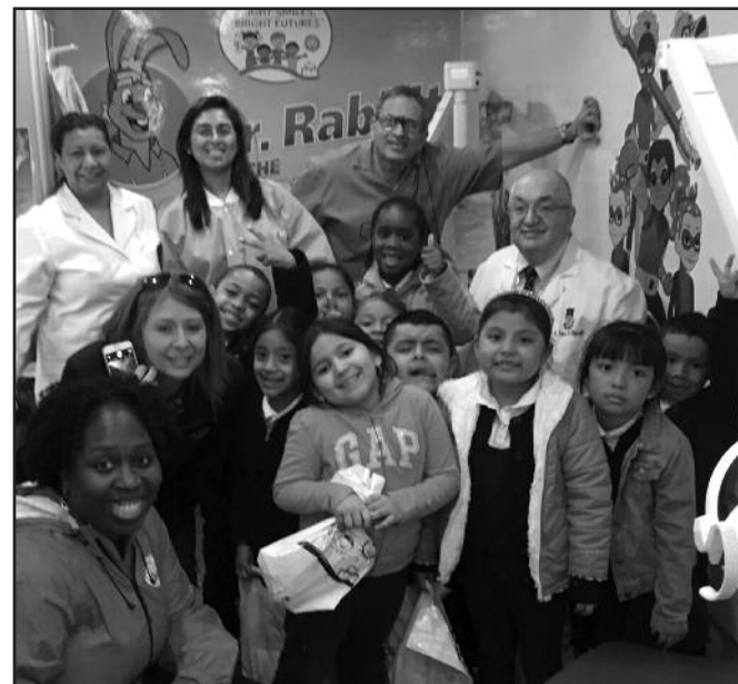
The QCDS volunteer doctors with children they examined.

QCDS members interested in volunteering for future dental screening events should call the QCDS office, (718) 454-8344.