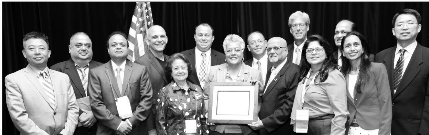
The Queens County Dental Society delegation accepted the Hallmark of Excellence Award for Education and Information at this year's NYSDA House of Delegates Meeting.

On the first day of the 2016 New York State Dental Association House of Delegates Meeting in June, the Queens County Dental Society was honored with the only "Hallmark of Excellence" award. This award was presented for the field of education and information. The last time QCDS received this award was in 2007. The award was given for the "Friends of QCDS" event held last year.