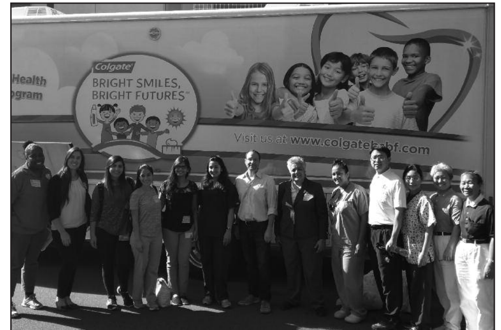
QCDS volunteer dentists assembled in front of the "Bright Smiles, Bright Futures" van provided by Colgate.

This event was part of the National Give Kids A Smile program, sponsored by the American Dental Association,