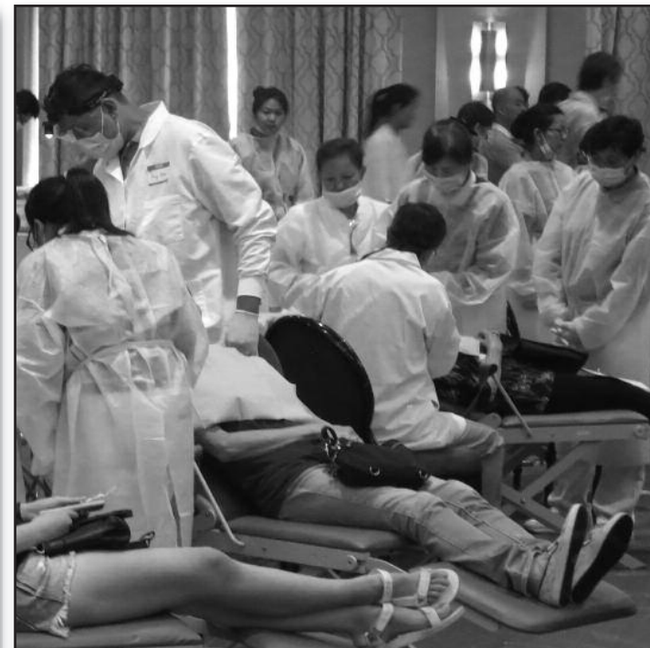
Volunteer doctors examining patients